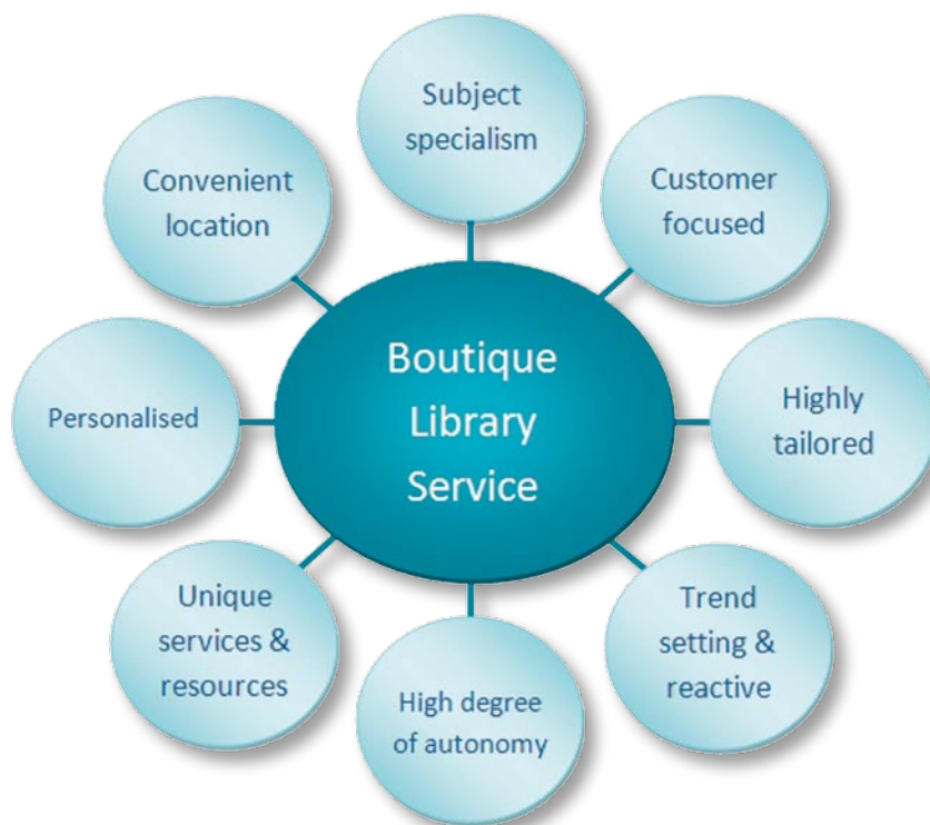
Fig 2. Boutique service features.

Centrally managed activities are essential for effective and efficient services. In the case of electronic provision there is often no other option and, providing effective two-way communication is in place, they can enhance resources and services. The boutique service needs to recognise and work with such activities. Partnerships that develop through recognising that co-operation and collaboration will enhance service excellence form a third element to the model. Collaborative activities may depend on goodwill, and often ebb and flow according to personalities and service focus. A boutique service model sees collaborative ventures (both internal and